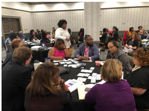
Participants attending a training session on making data-driven decisions.